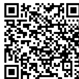
QR Code Example

The QR code is applied to a special report from within CGM SCHUYLAB , and that mobile-friendly link points securely to the original results in CGM SCHUYNET . This second layer of verification confirms the authenticity of the paper result report.